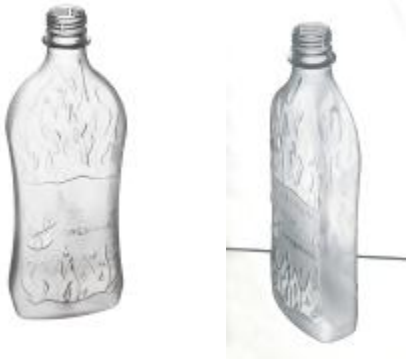
Picture 4 - 5 : Magplastic hipflask bottle with preferential heating